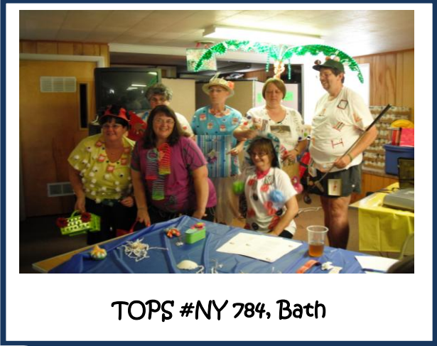
TOPS #NY 784, Bath