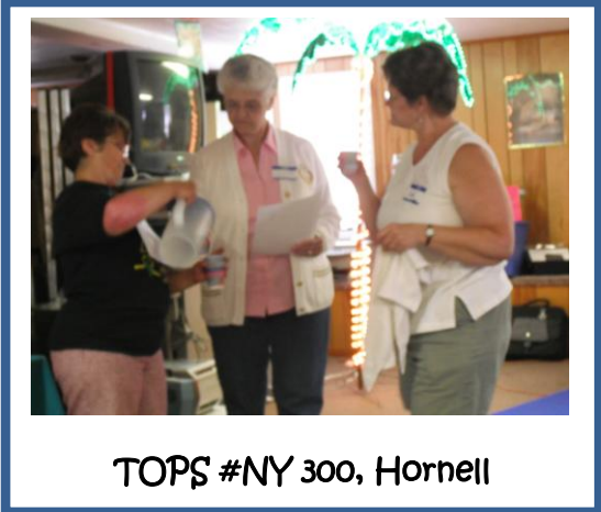
TOPS #NY 300, Hornell